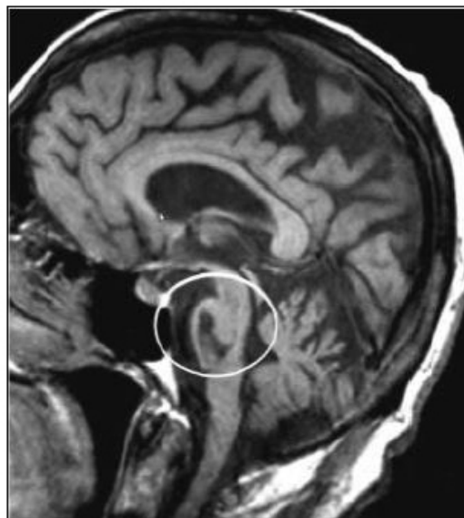
Fig. (1). Ventral brainstem lesion in locked-in syndrome.

Healthy volunteers matching patients for age, sex and education, free from neurological or psychiatric disorders and with normal MR imaging, were also included in the study.